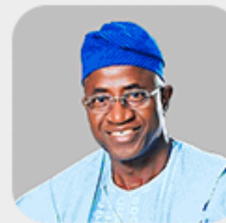
Chief Olusegun Odegbami Nigerian Professional Footballer