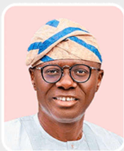
Babajide Olusola Sanwo-Olu Governor of Lagos State Chief Host